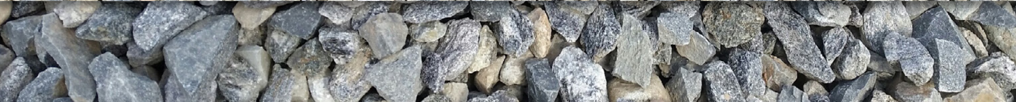
1 1/2" RECYCLED CLEAN STONE