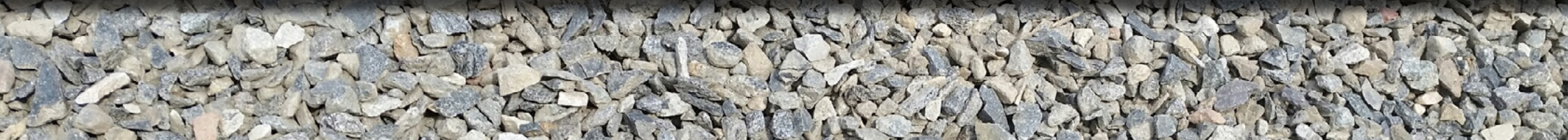
3/8" RECYCLED CLEAN STONE